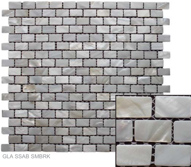
GLA SSAB SMBRK