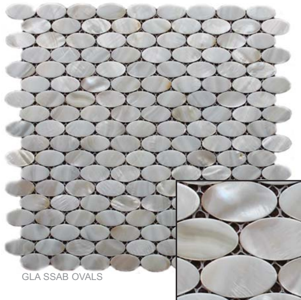
GLA SSAB OVALS