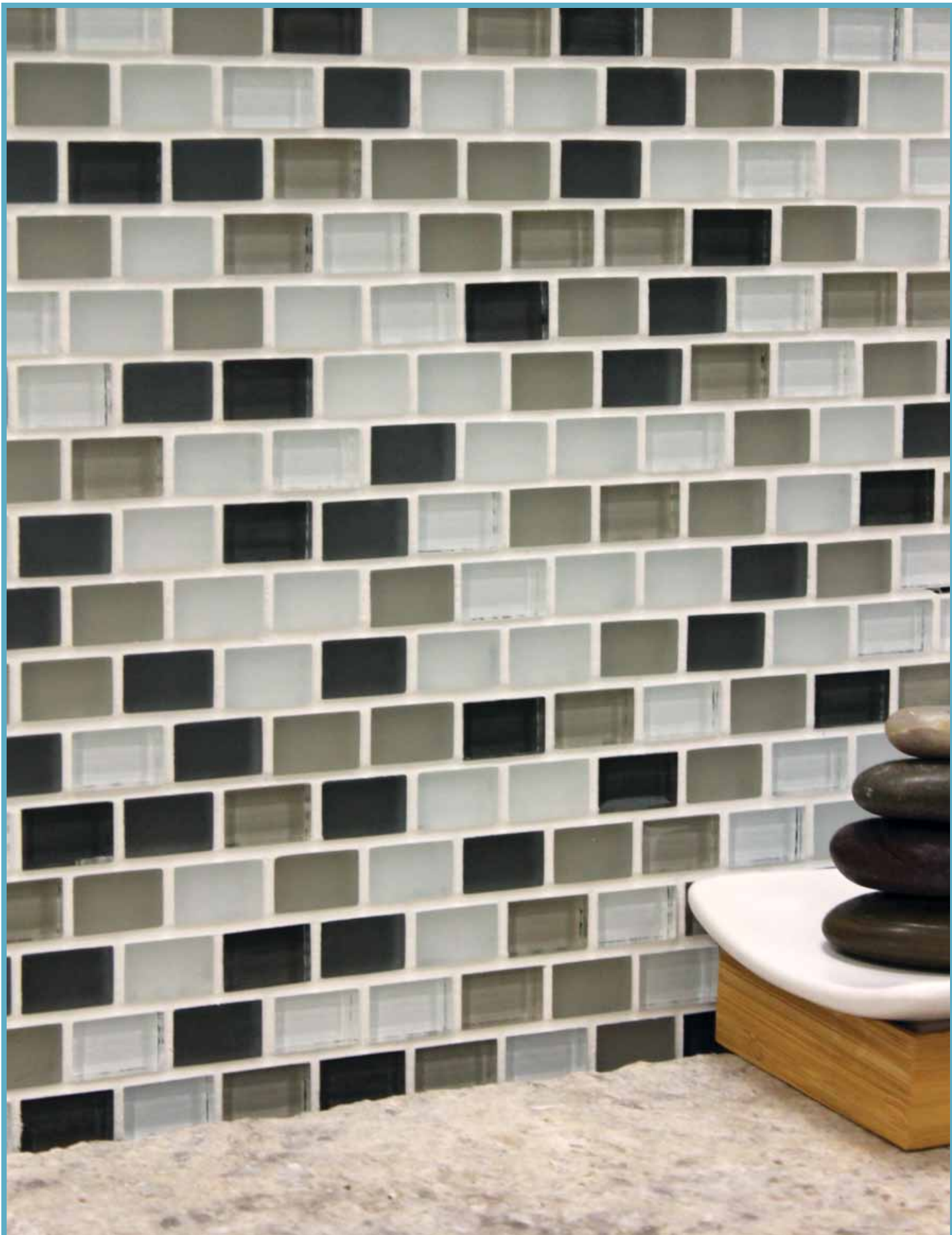
STONE • Small Brick