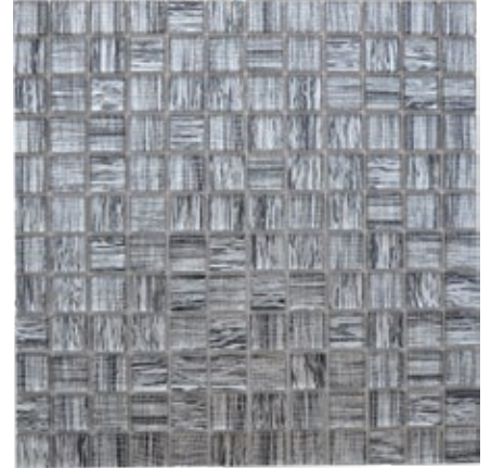
| 1x1 mosaic |