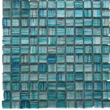
| 1x1 mosaic |