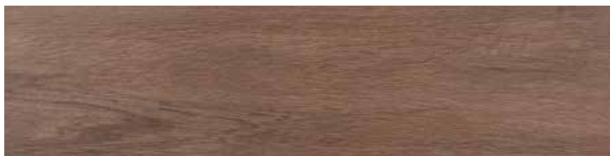
| 9 x 36 |