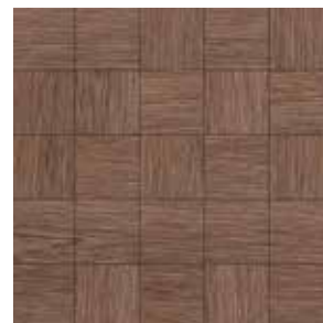
| 2 x 2 mosaic |