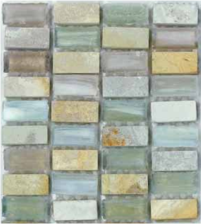
GLA HABE STACK