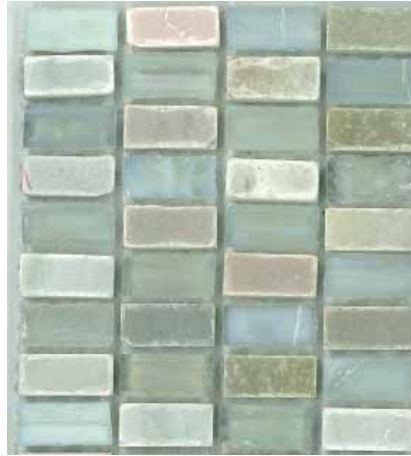
GLA HADU STACK