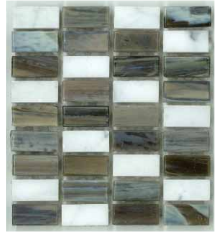
GLA HAHA STACK