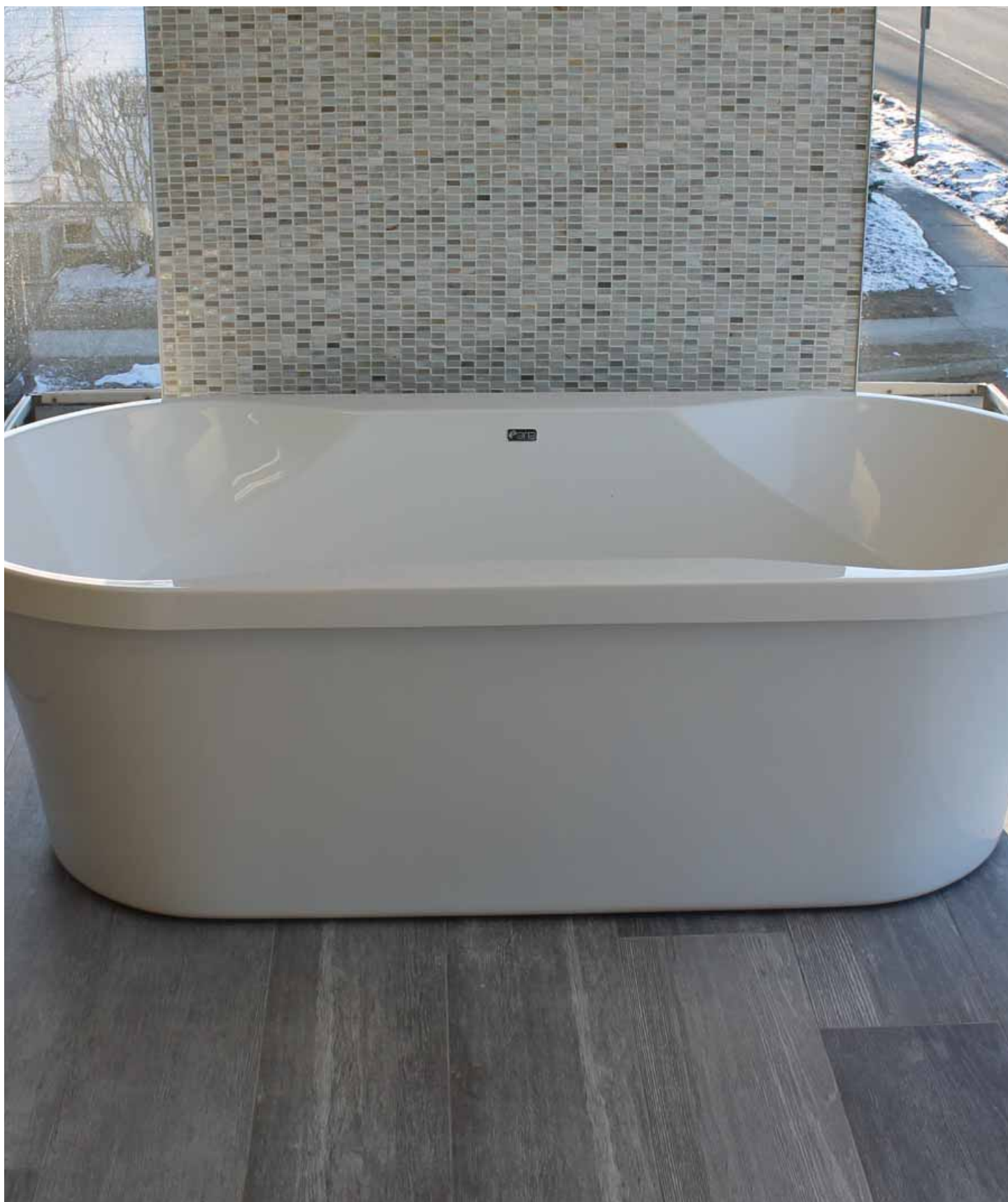
backsplash • HAMPTON DUNES | floor • ALBERO 6 SHADE