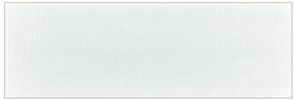
GLACGSW412STRA | 4 x 12 striated |