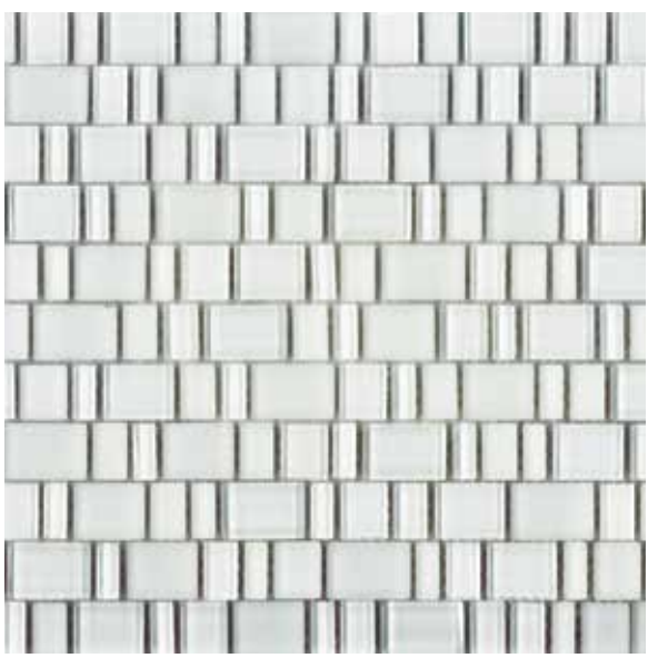
GLACGSWBOND | bond mosaic |