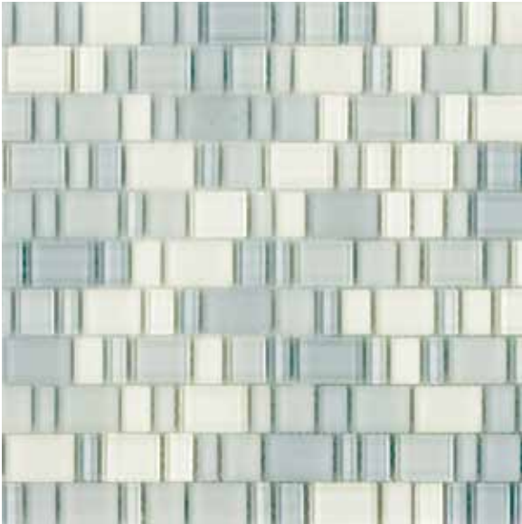
GLACGFOBOND | bond mosaic |