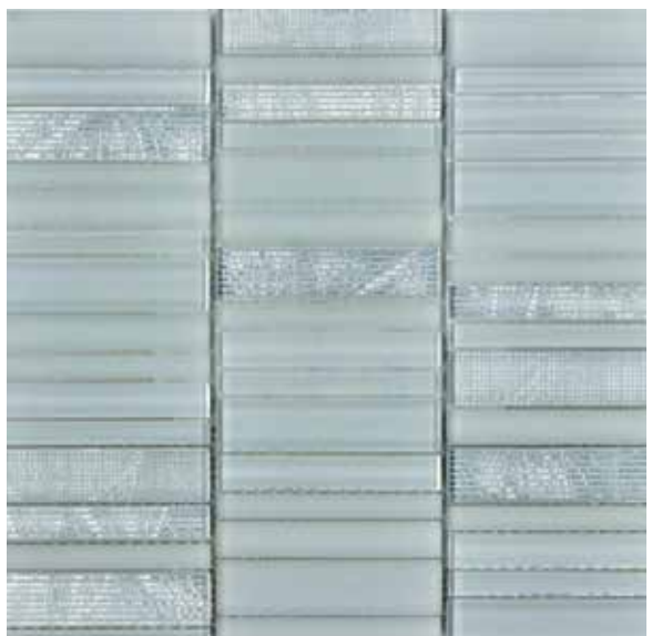
GLACGCLPIXI | pixi mosaic |