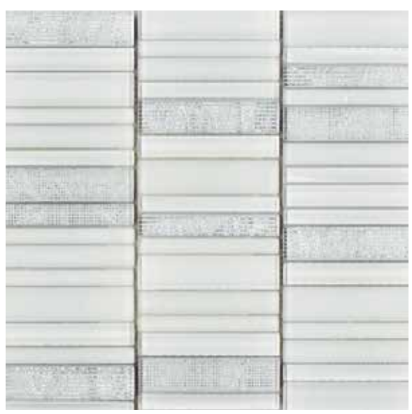
GLACGSWPIXI | pixi mosaic |