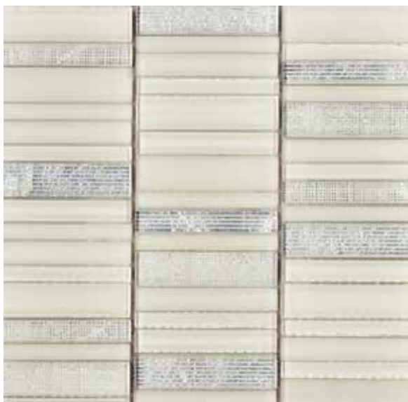
GLACGBIPIXI | pixi mosaic |