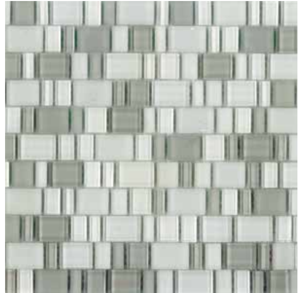
GLACGGGBOND | bond mosaic |