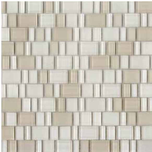
GLACGBIBOND | bond mosaic |