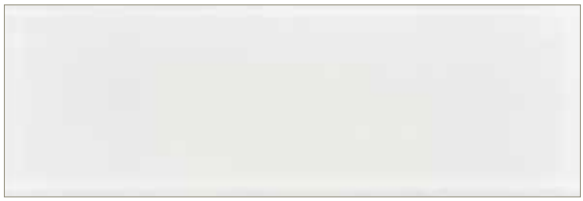
GLACGSW412 | 4 x 12 |