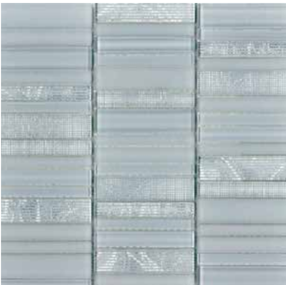
GLACGFOPIXI | pixi mosaic |