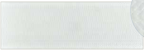
GLACGSW412CHEV | 4 x 12 chevron |