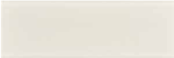
GLACGBI412 | 4 x 12 |