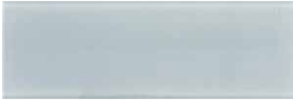
GLACGFO412 | 4 x 12 |