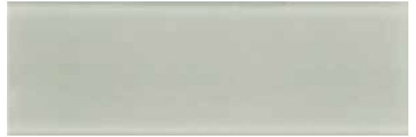
GLACGGG412 | 4 x 12 |