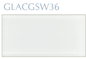
GLACGSW36 | 3 x 6 |