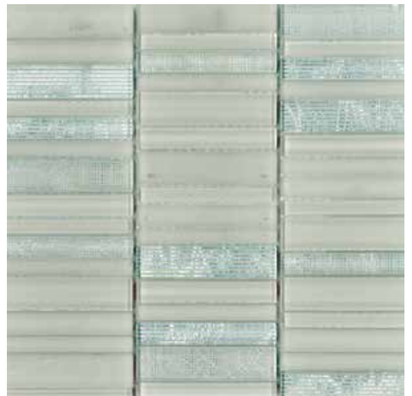
GLACGGGPIXI | pixi mosaic |