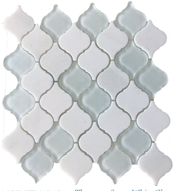
MOSWJTWARAB Thassos + Super White Glass