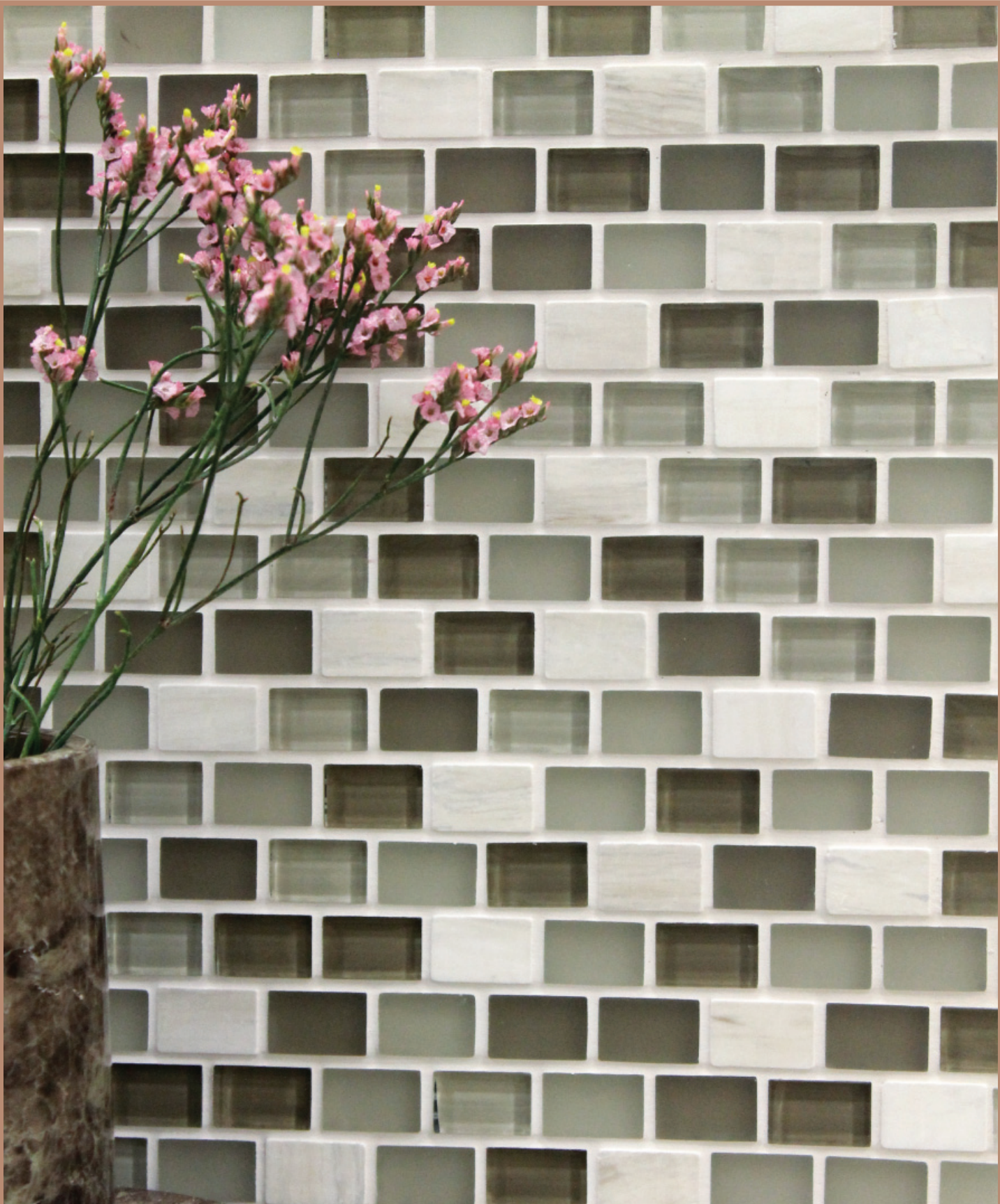
PLAGE • Small Brick