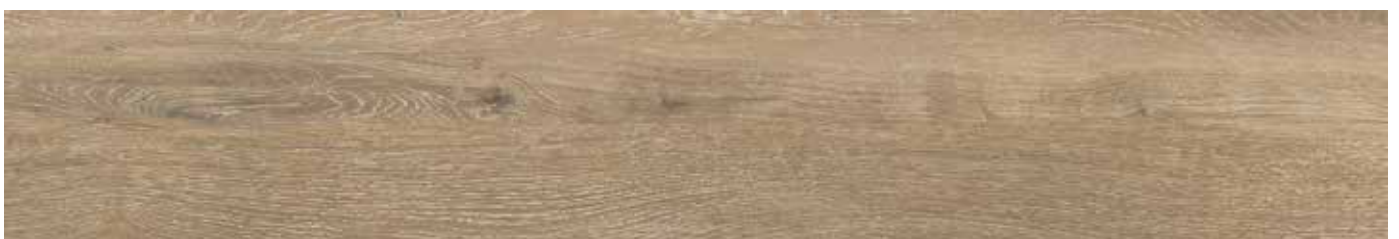
| 8 x 48 |