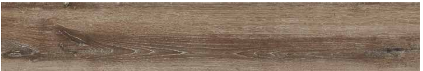
| 8 x 48 |