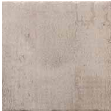
| 12 x 12 |