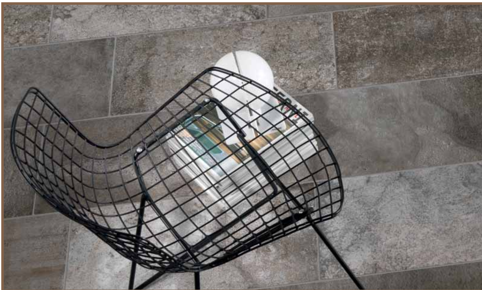
DOM ROCO 24