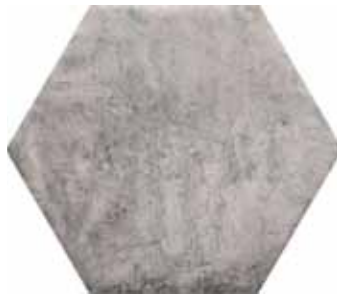
| 10 x 10 |