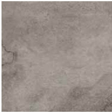
| 12 x 12 |