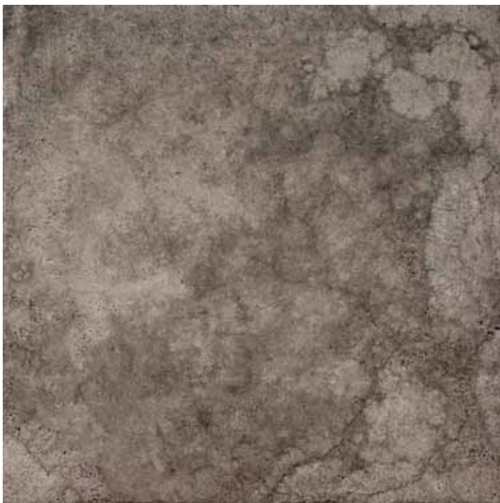
| 24 x 24 |