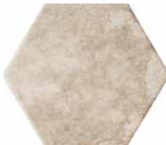
| 10 x 10 | hexagon