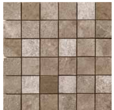
DOM ROHA MOS22