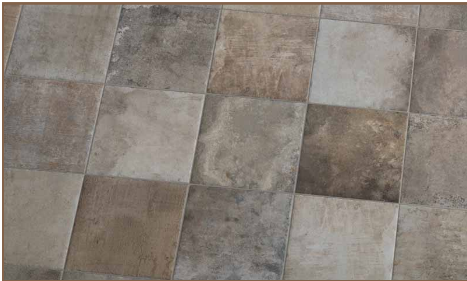
DOM ROHA 24