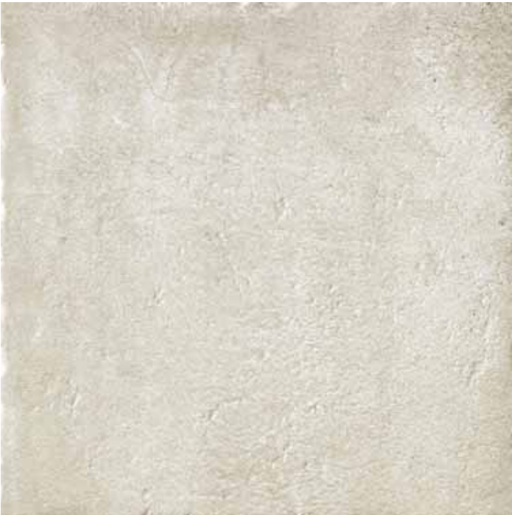
| 24 x 24 |