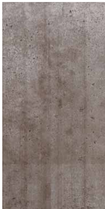
| 12 x 24 |