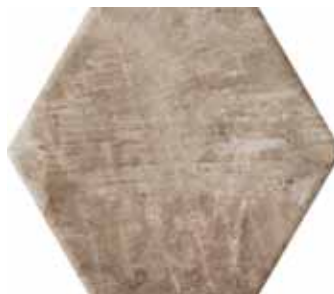
DOM ROHA HEX10