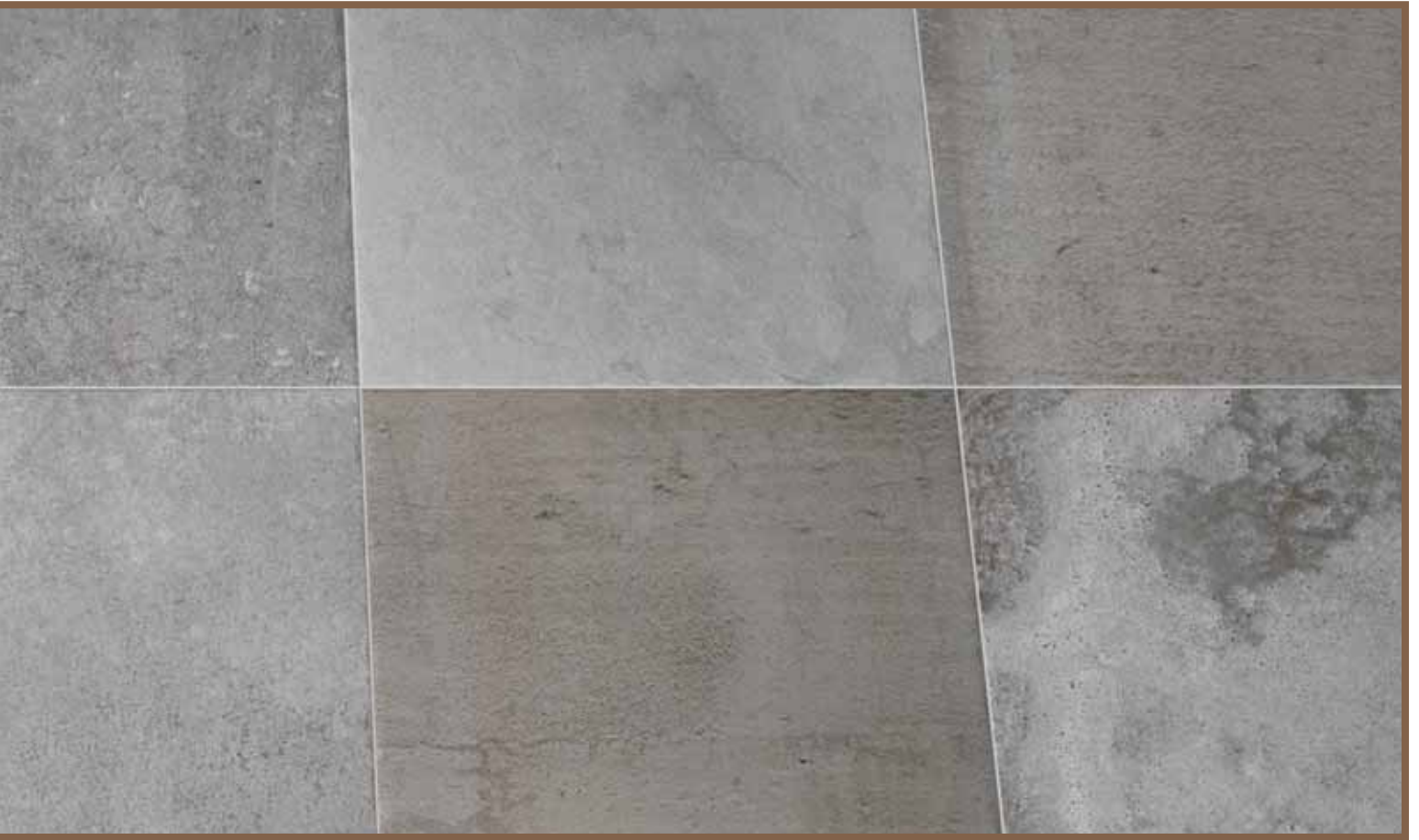
DOM ROSI 12