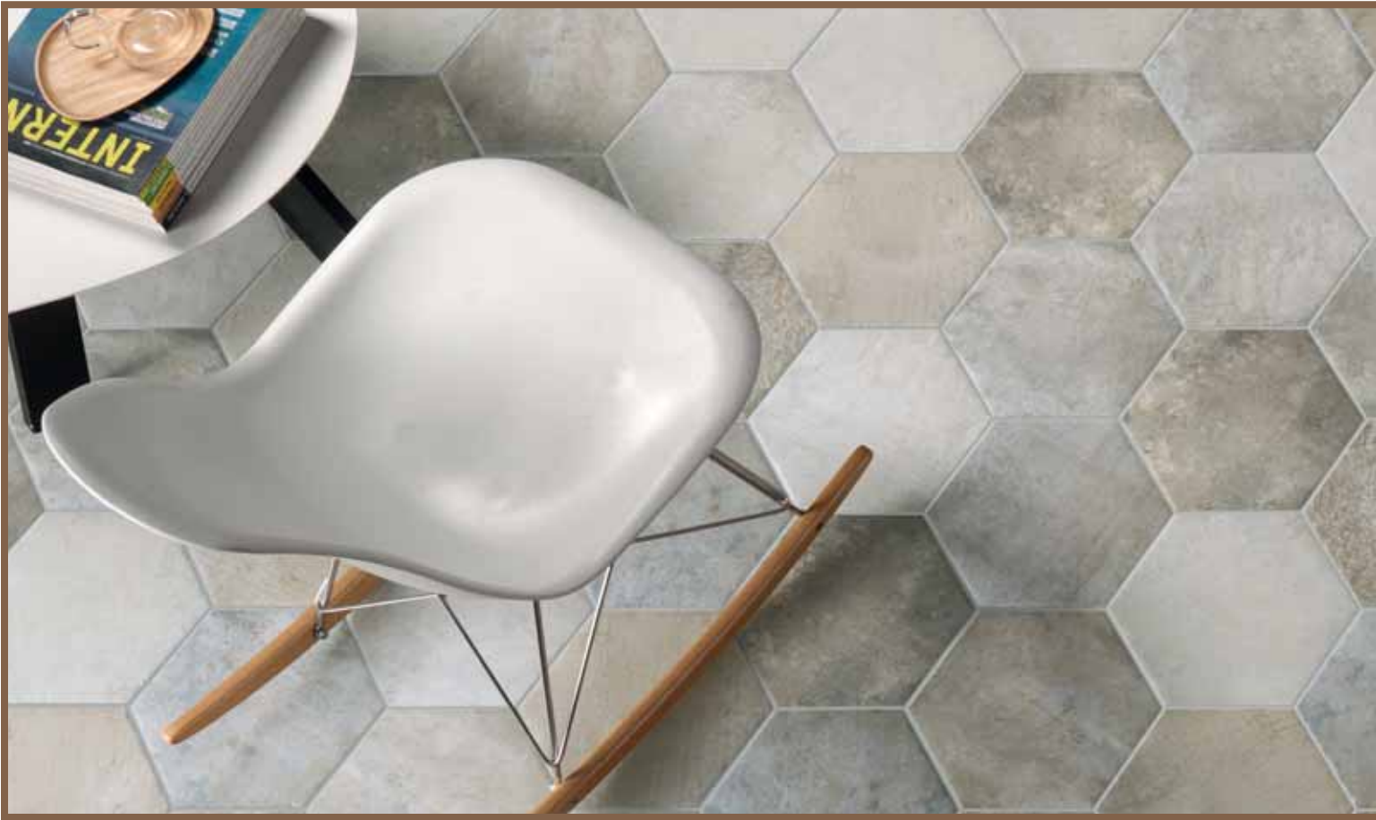
DOM ROLU 24