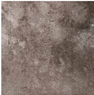
| 12 x 12 |