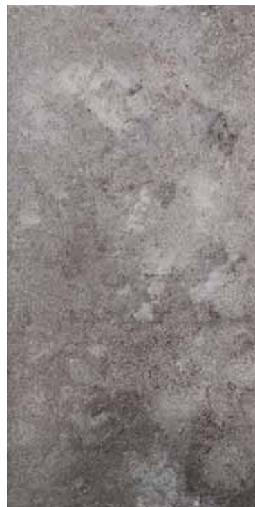
| 12 x 24 |