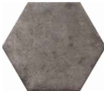
| 10 x 10 | hexagon