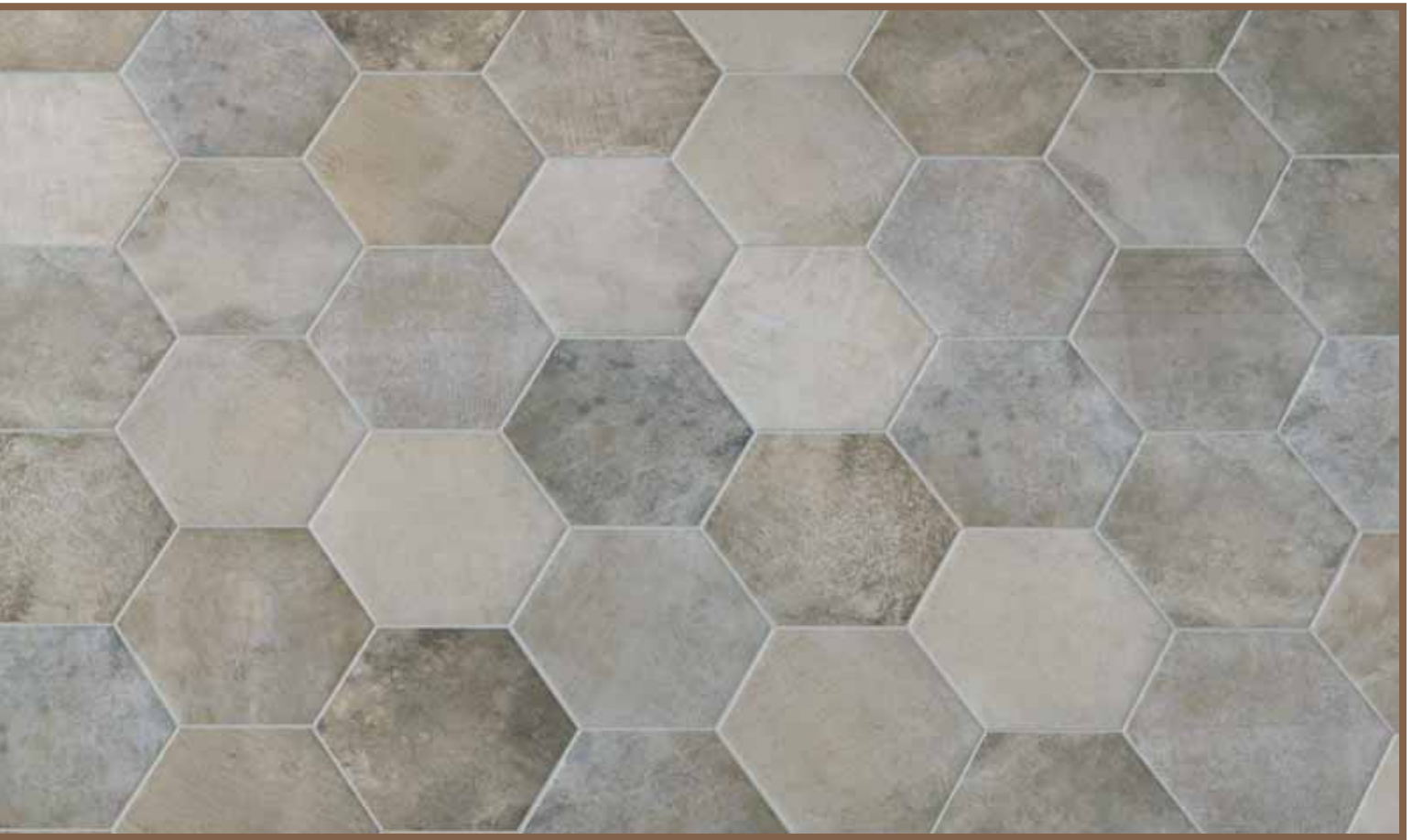
DOM ROLU 12