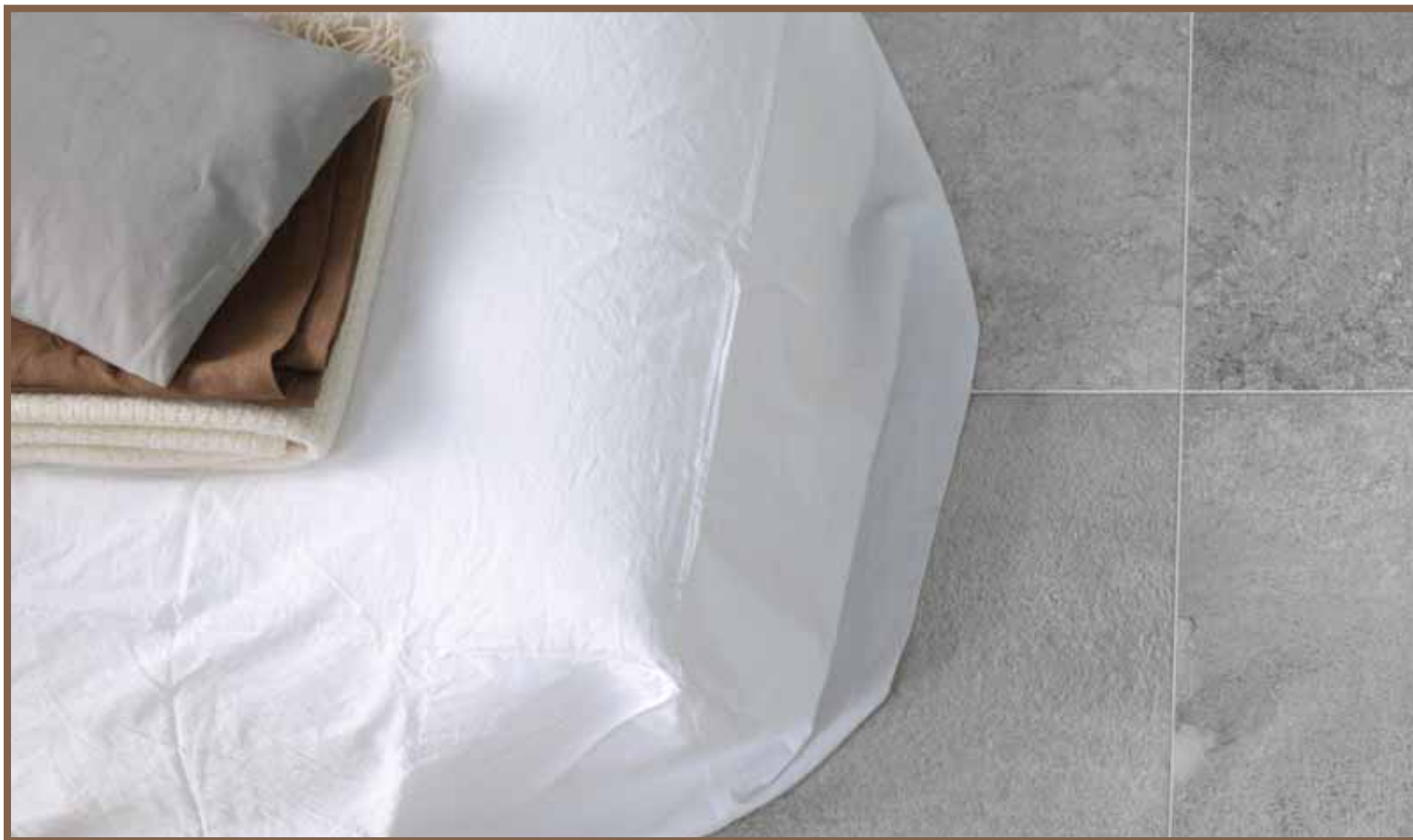
DOM ROSI 24