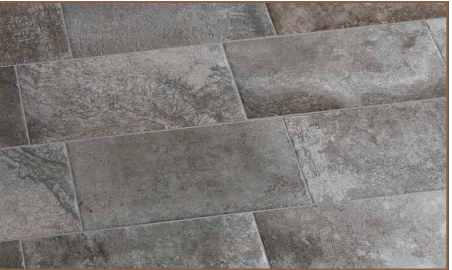
DOM ROCO 12