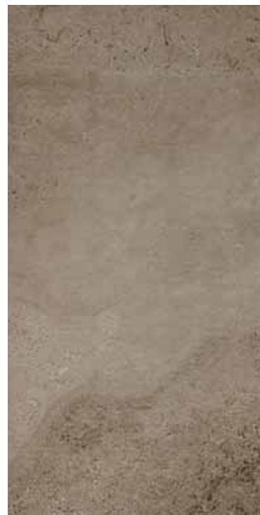
DOM ROHA 1224