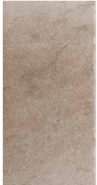
| 12 x 24 |