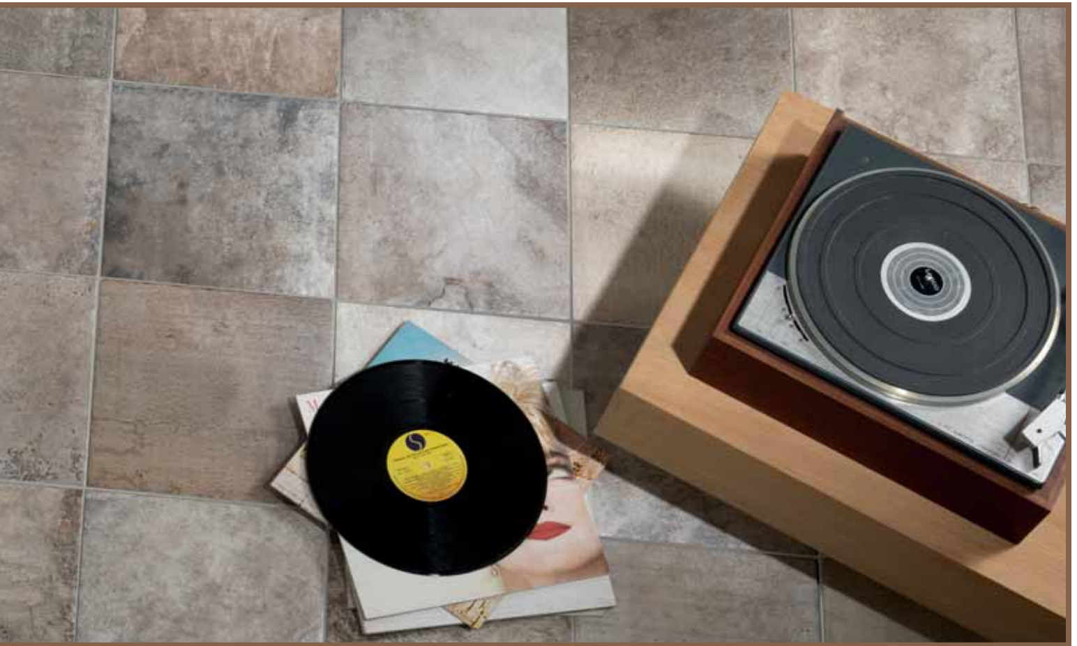
DOM ROHA 12