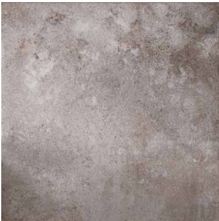
| 24 x 24 |